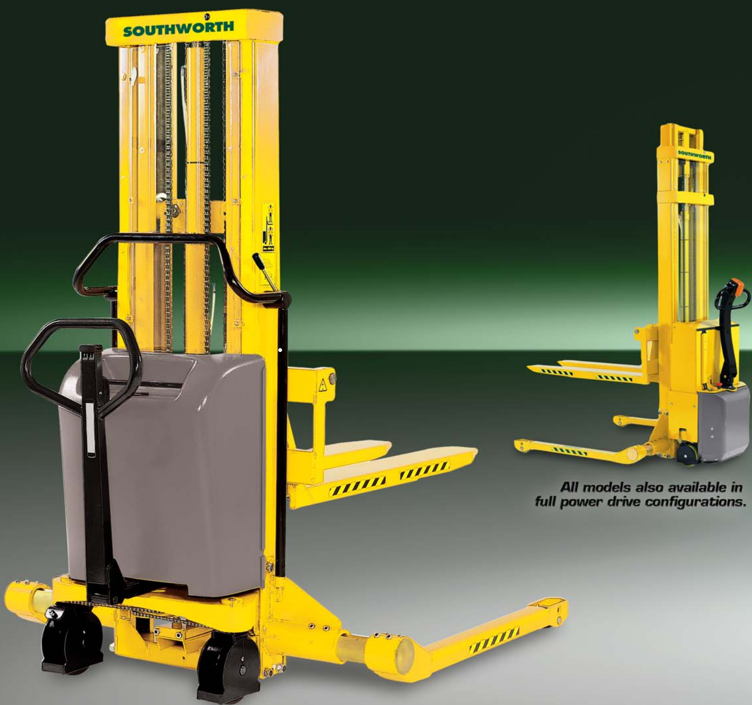
All models also available in full power drive configurations.