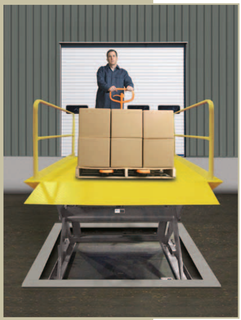
M - Series dock lift featuring Dura-Dock<sup>™</sup> weatherproof construction.