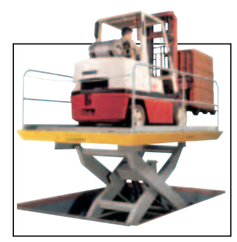
H - Series dock lift for heavy loads (over 10,000 lbs.) and/or forklift accessibility.

Southworth offers seven standard dock lift models with capacities from 5,000 to 20,000 lbs., platform sizes up to 8' x 12' and a variety of installation configurations to accommodate any loading dock requirement. Models featuring an "M" designation are built for use with two wheel dollies, hand carts, and hand pallet trucks. "H" model designations can be used with powered devices like powered pallet trucks, counterbalanced stackers and fork lift trucks.