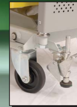
Smooth rolling casters and floor lock