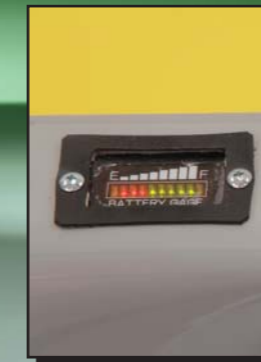
Battery status indicator and onboard charger