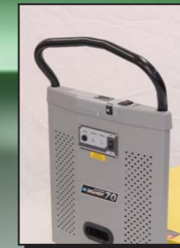
Ergonomic comfort shape handle