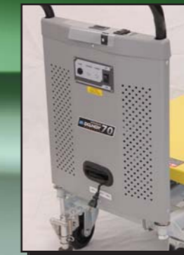
Full shielding of all electrical components