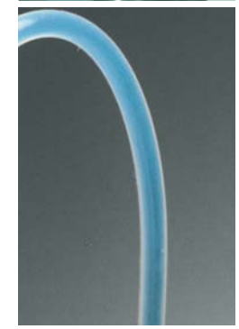
Tell-Tale Return Hydraulic Fluid Line

Torque tubes minimize platform twisting and deflection for high degree of rigidity and stability.