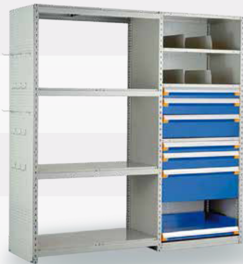
Evolution Spider® Shelving System