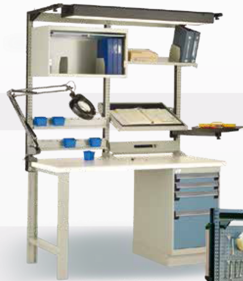
Organization Workstation System