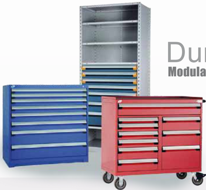
Durability Modular Drawer System