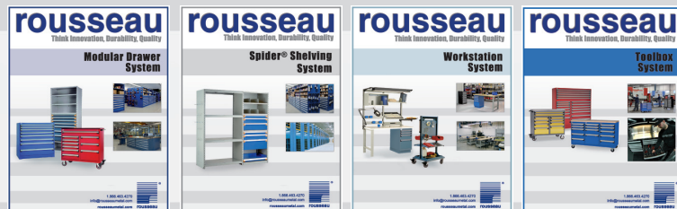
Modular Drawer System