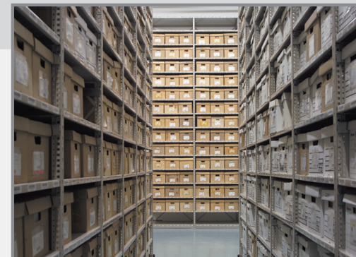
CDSA, City of Québec

With the Rousseau record storage system, wasted space is a thing of the past. Our specially constructed shelving system was designed with the popular sizes of record storage boxes in mind.