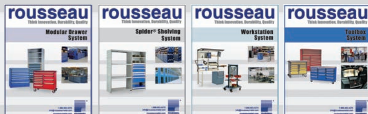
Modular Drawer System Spider® Shelving System Workstation System Toolbox System