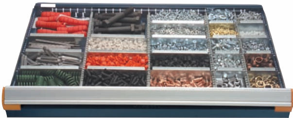
400 lb capacity - 100% extension

The Rousseau drawer has significant advantages: The drawers are available in 10 heights with a 400 lb. capacity per drawer and 100% access to drawer contents. In addition, there is a Lifetime Warranty on the rolling mechanism.