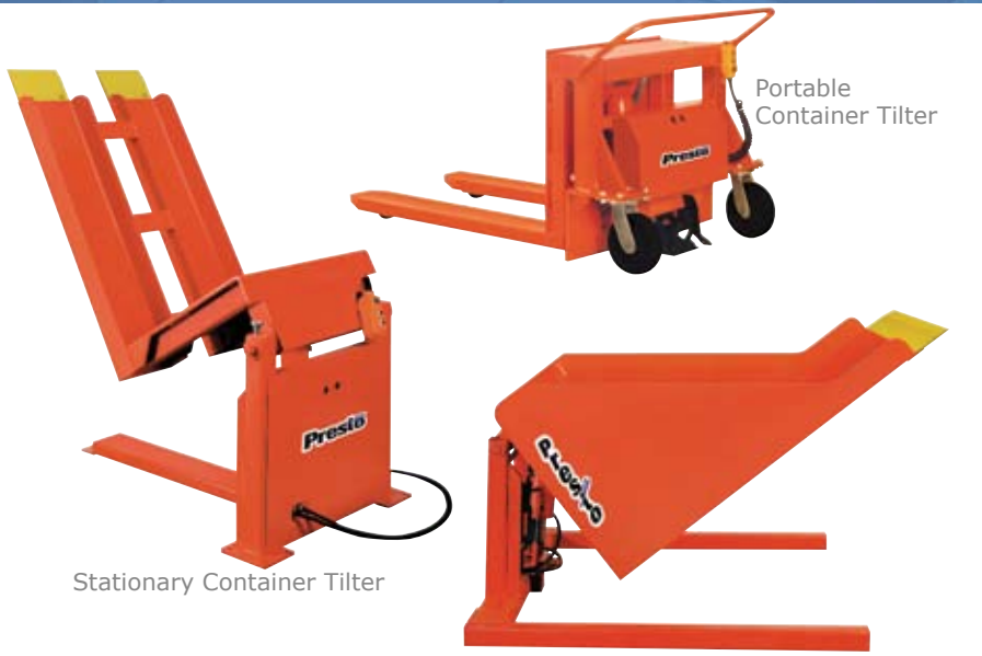
Floor Level Container Tilter

Position containers and wire baskets at a comfortable height for accessing contents. Available in 2,000 and 4,000 lb capacities with 89° of tilt. Stationary units can be fed with hand pallet trucks. DC powered portable units are ideal for sharing between work cells or retrieving staged containers. Floor Level units work with any style of container and can also be fed by a hand pallet truck.