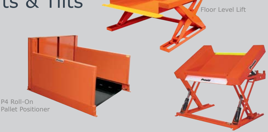
Floor Level Lift & Tilt Table

Presto's wide variety of floor level equipment can be fed with ordinary hand pallet trucks, eliminating the need for fork lift trucks and trained operators. Lift only and Lift & Tilt models are available.