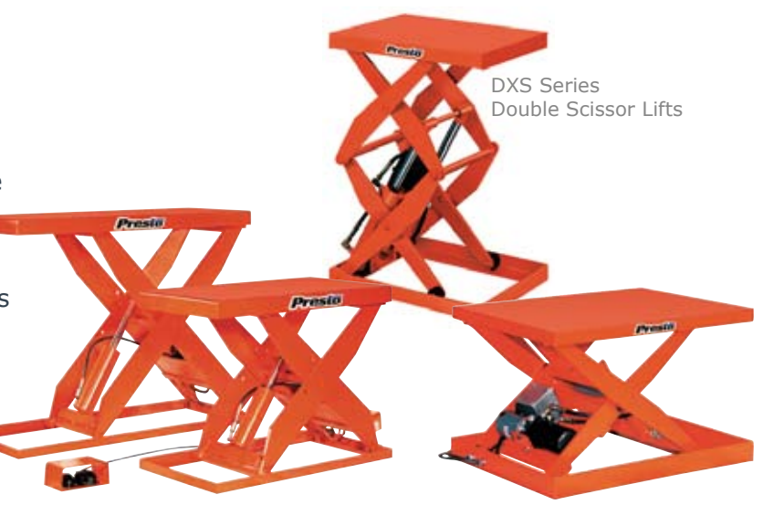
XL Series Standard Duty Scissor Lifts

Presto Lifts offers a full line of Hydraulic Scissor Lift Tables with capacities up to 8,000 lbs available in: Light Duty, Standard Duty, Heavy Duty, and Double High configurations. They position material at just the right level, thus eliminating bending, stretching, lifting, and reaching.