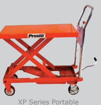
XP Series Portable Manual Scissor Lift