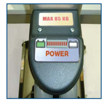
Oversized ergonomic "sponge-grip" handle Pushbutton remote control is mounted Wheels feature brake locks for safety conveniently on the handle, and has a while loading or unloading, steering lock power information at a glance. Onboard provides operator comfort and a variety of telephone style cord for remote operation for straightline travel, and protective charger provides quick battery recharging. toe guards.