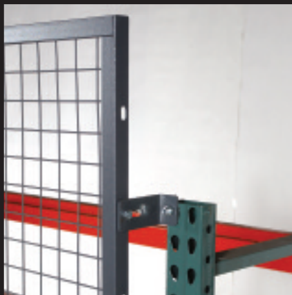
Panels extend above top beam for complete protection