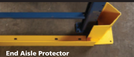
End Aisle Protector