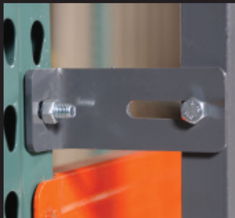
Mounting brackets allow for pallet over-hang