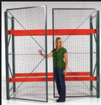
Hinged doors for rack enclosure

6208 Strawberry Lane Louisville, KY 40214 800-626-1816 www.wirecrafters.com