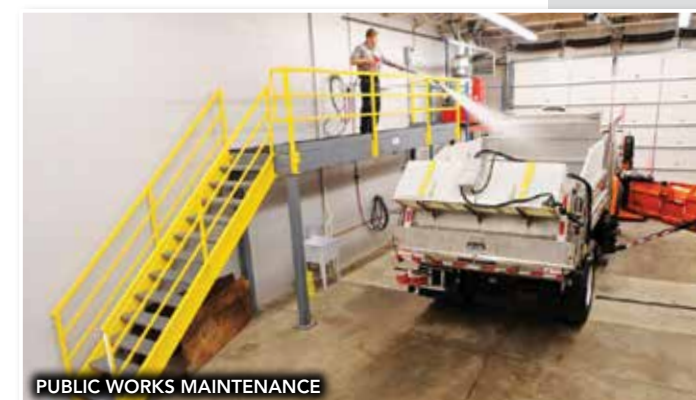
PUBLIC WORKS MAINTENANCE