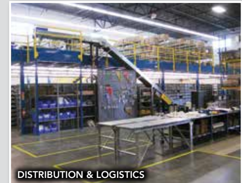
DISTRIBUTION & LOGISTICS