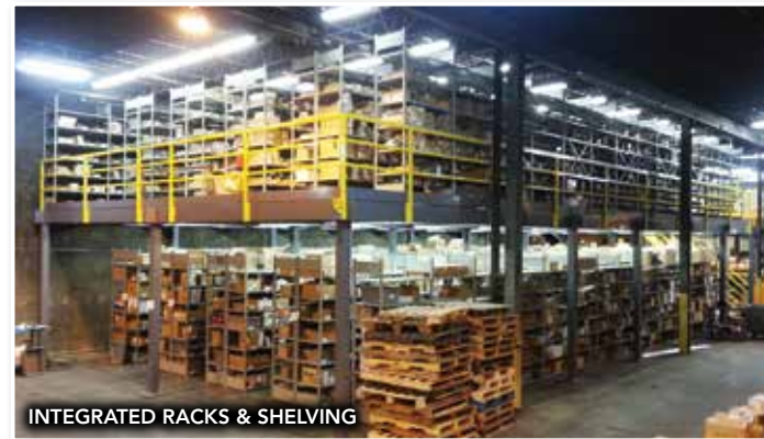
INTEGRATED RACKS & SHELVING