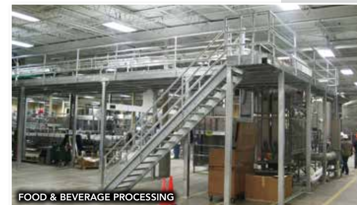
FOOD & BEVERAGE PROCESSING