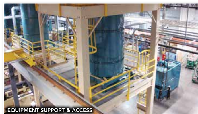
EQUIPMENT SUPPORT & ACCESS