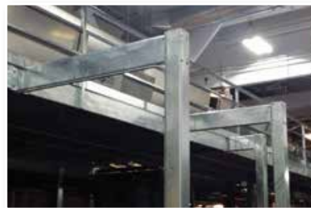
Fastener connection design minimizes exposed threads