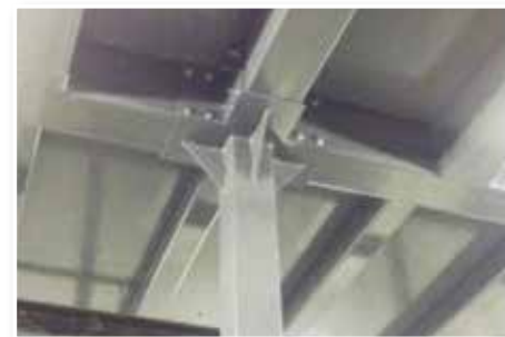
Enclosed square/rectangle tube steel