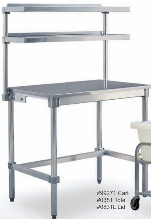
#99271 Cart #0381 Tote #0831L Lid