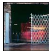
(Pair Folding Gates)