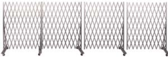
STARTER 12 FEET + ADD-ON 6 FEET + ADD-ON 6 FEET