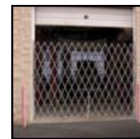
(Single Folding Gates)